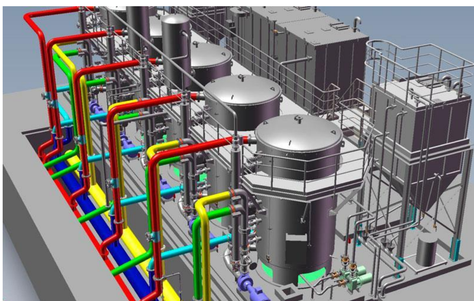
Fig 2. Refinery Network Topology